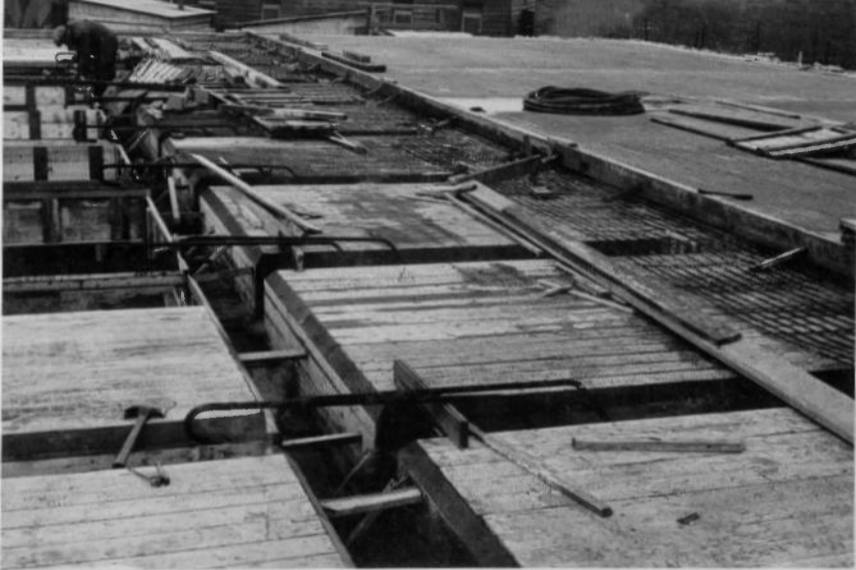
Service Reservoir showing roof. 1940.