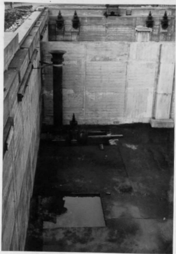
Service Reservoir showing four, inlet valves and overflow.