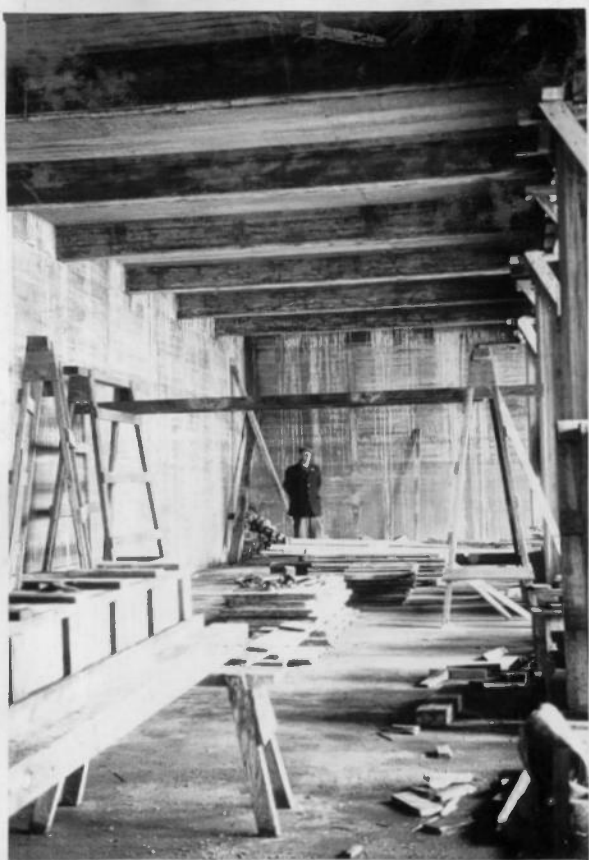
CORBY WORKS SERVICE RESERVOIR 1940 General View.