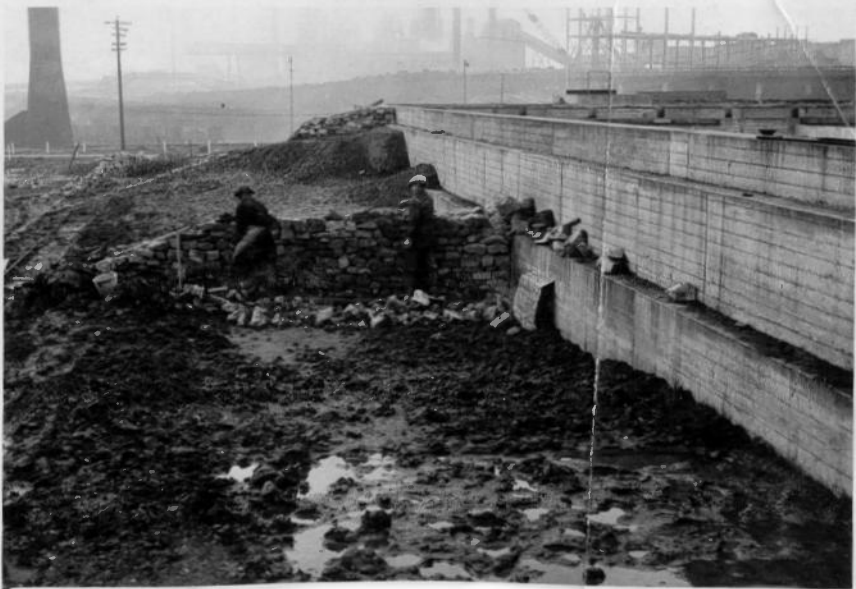
Showing mass concrete construction. Wall thickened at deeper depths, and sloping dry stone toes.