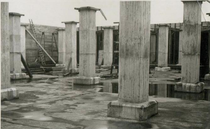
Service Reservoir showing pillars.