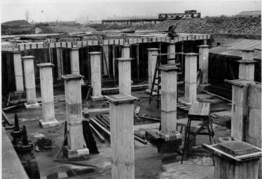
Pillar supports, also showing beam to carry roof.