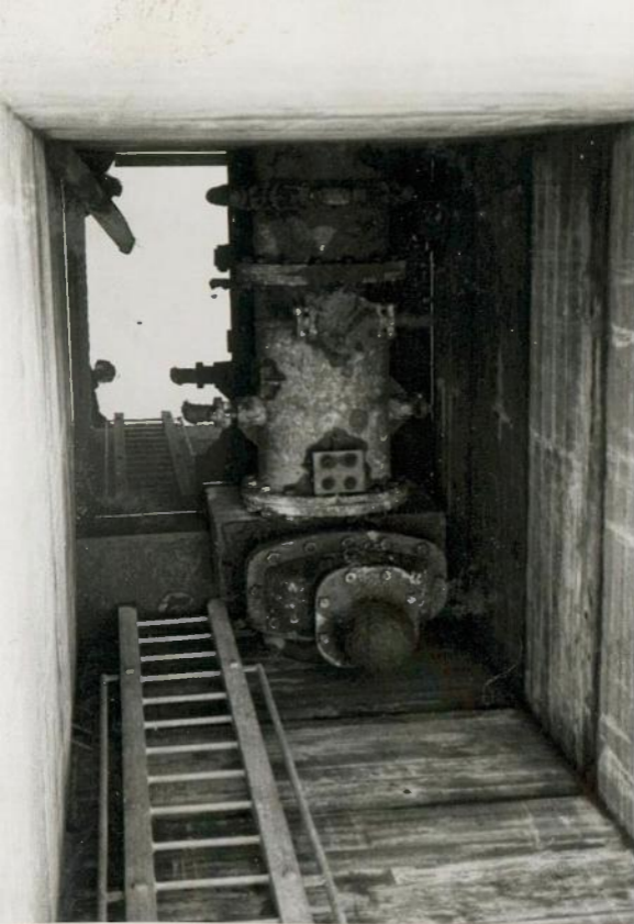
COREY WORKS SERVICE RESERVOIR