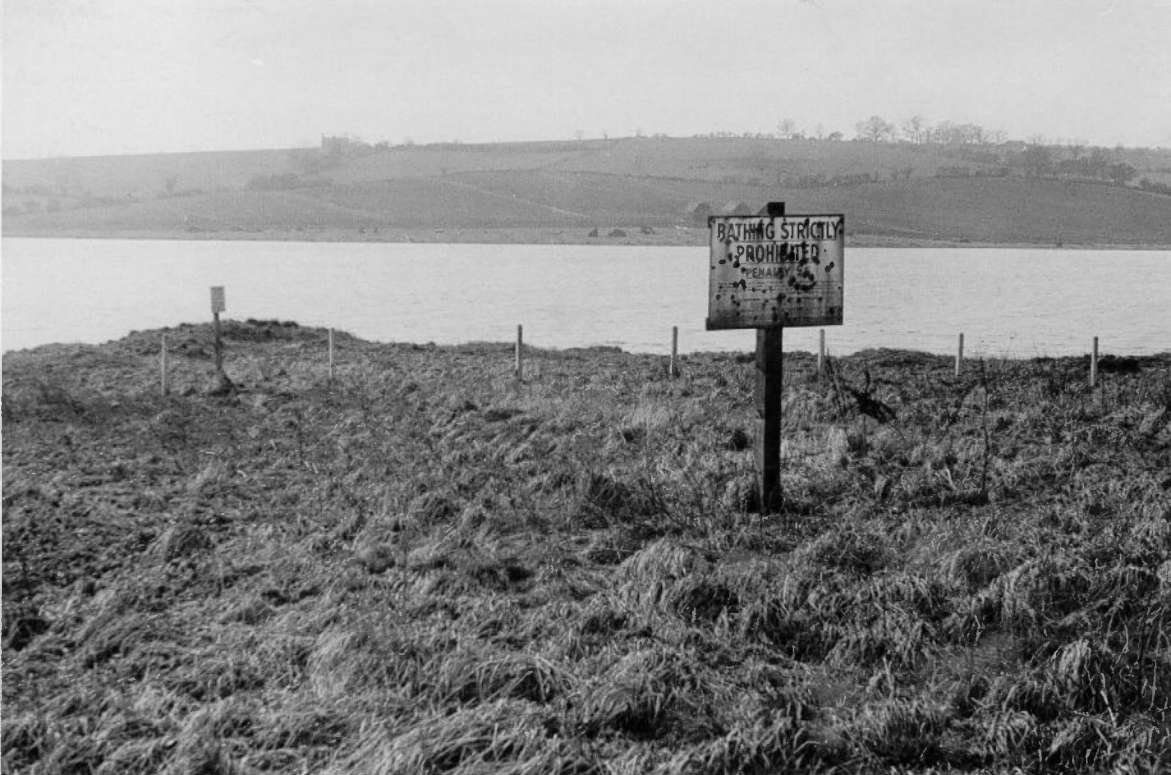
Old road to Stoke Dry Bridge, Rutland bank 6th February 1945.